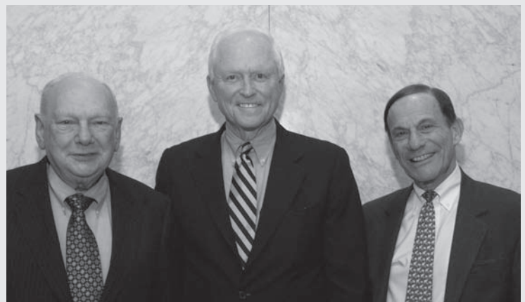
Past MLSC Board Chairs: Herbert S. Garten, Benjamin R. Civiletti, Herbert J. Belgrad.